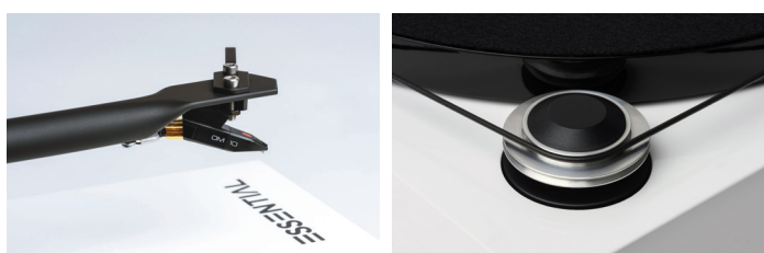
One piece 8.6" aluminum tonearm Cartridge: Ortofon OM10