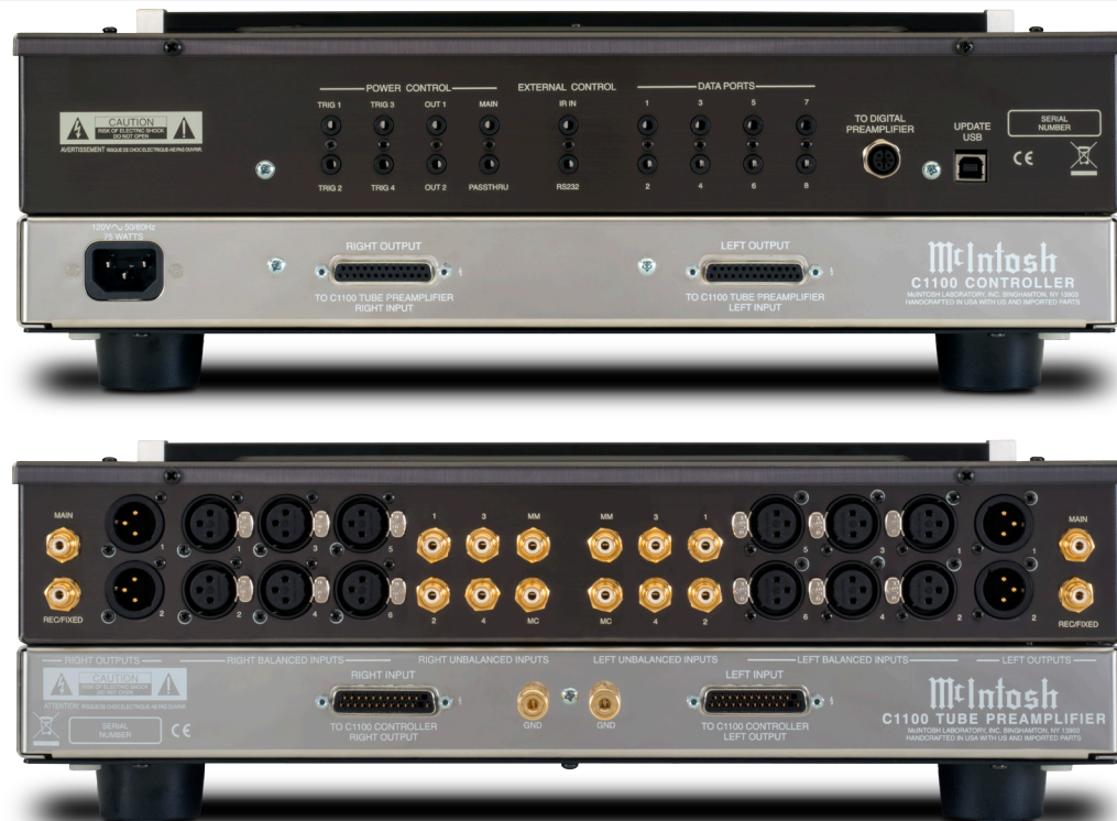
Top: Controller Bottom: Tube Preamplifier

Controller: 27 lbs (12.3kg) net, 43.5 lbs (19.7kg) in shipping carton; Tube Preamplifier: 25 lbs (11.3kg) net, 39.5 lbs (17.9kg) in shipping carton